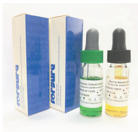
** single vial packing